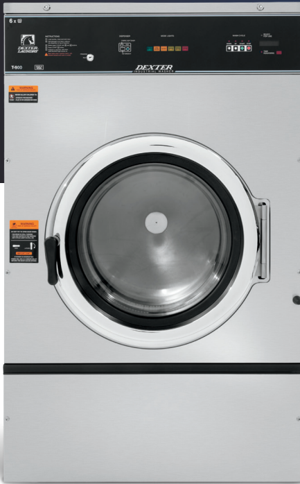
6 Cycle Control